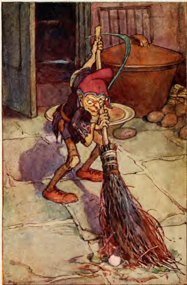
The Brownie (see p. 17)